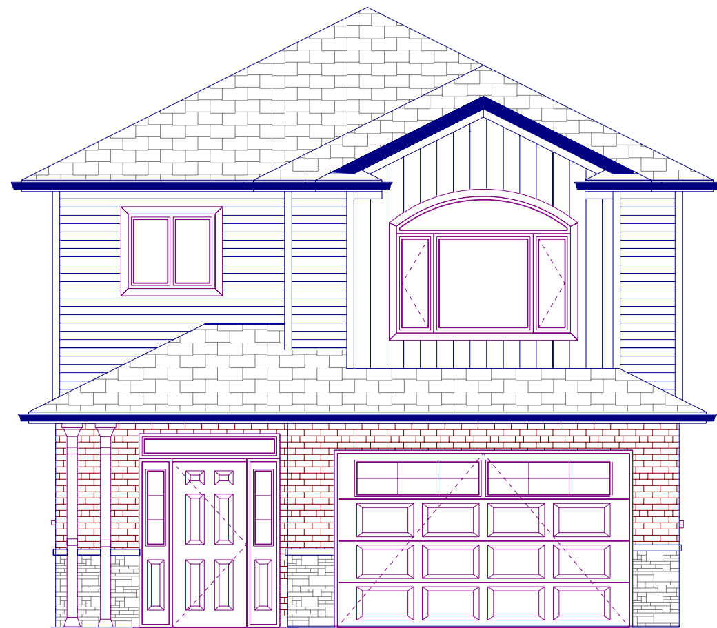
FRONT ELEVATION A